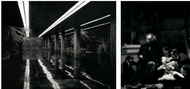
Taryn Simon, Interior of The Palace of the Revolution, Havana, Cuba , 2002; Thomas Eakins, The Gross Clinic , 1875

In Simon's photography, the American soil is wrapped up in a political, cultural, and economic quagmire, yet it never fails to offer unexpected splendors. As her photograph of a fireworks display informs us, this is where the largest American firework